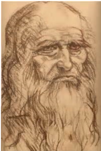
(Leonardo Da Vinci)

If you wish to show to your students, these are some famous self-portraits: